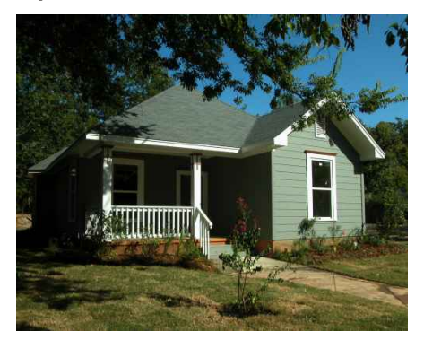
The first of several homes to be built in Paris.

In many CHRISTUS communities today, quality affordable homes are under construction thanks to the support of the CHRISTUS Community Direct Investment (CDI) program, CHRISTUS Associates and their neighbors are realizing their dreams of becoming first-time homebuyers. As part of its commitment to creating healthier communities, CHRISTUS invests money with local not-for-profit organizations to support community development. By encouraging the hard work of committed local leaders, the CDI program helps to build local capacity. The CDI program plays the role of initiator, facilitator, partner, and/or investor depending on the situation in each community.