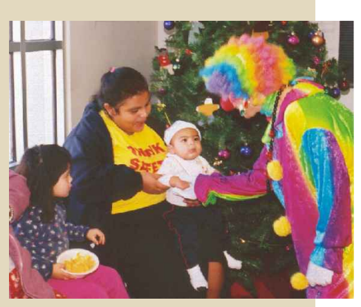
Families at the CHRISTUS Southwest Health Center in Houston enjoy the festivities and presentations at their Christmas party.

CHRISTUS News is produced as a communication tool by CHRISTUS Health and is distributed through the system communications office.